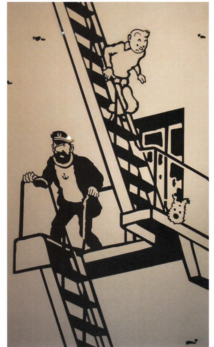
Acrylic on canvas laser cut acrylic sheet on canvas, 120x180x8 cm, 2011