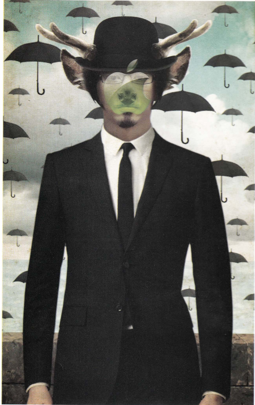
SON OF MAC print on canvas/ Photomontage 100 x 160 cm, 2013