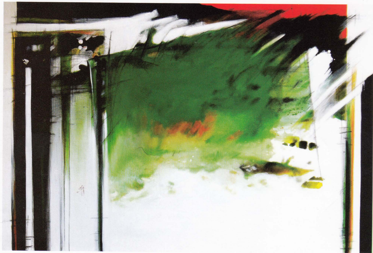
Locus #1 acrylik di atas kanvas 100 X 140 cm, 2013

DADANG SUDRAJAT Institut Teknologi Bandung