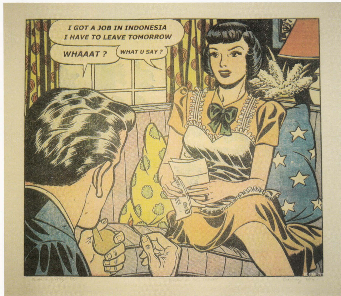
Become an Art Lecturer Photolithography on paper, 53 x 60 cm, 2013