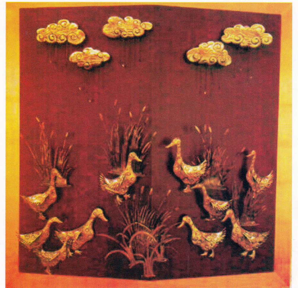
Musim penghujan logam kuningan, ukir, 1 x 1 m, 2012