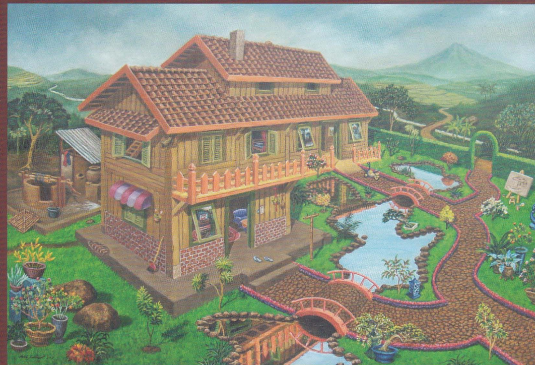
Ambiguitas Atas Bawah cat minyak di kanvas , 100 x 70 cm, 2013