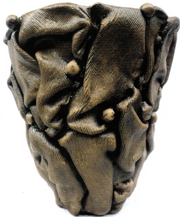
Titik Temu Keramik (Stoneware 1250°C) /Handbuilding 35 x 32,5 x 10 cm, 2012